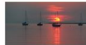
New Jersey Sunrise seen from N.J.