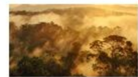
Rain forest vacations